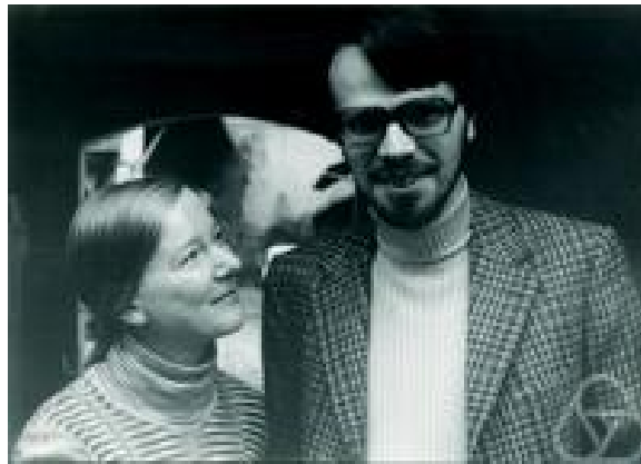
Figure 1: Erlangen 1972

This picture was taken by Konrad Jacobs when I was his doctoral student .