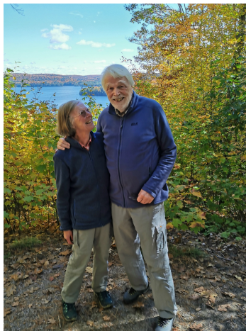
Figure 5: Canada 2024

40 years have passed since then, but friendships from those days are still alive and we were happy to visit last week several of our old Montréal friends.