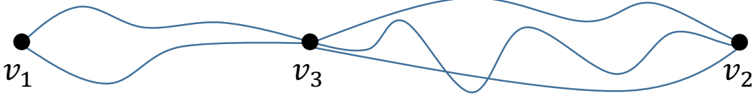
Figure 2: Paths in T_{i_0 j_0} are fixed at 3 vertices v_1, v_2, v_3 .

We consider the paths in T_{i_0 j_0} . These paths share the same (i_0 + 1) -th vertex. We denote this vertex by v_3 . Every path in T_{i_0 j_0} can be considered as two parts, the head from v_1 to v_3 (with length i_0 ) and the tail from v_3 to v_2 (with length k - i_0 ). We will assume that i_0 \leq k/2 , so that the head not longer than the tail. If this condition does not hold, we can interchange the definition of head and tail.